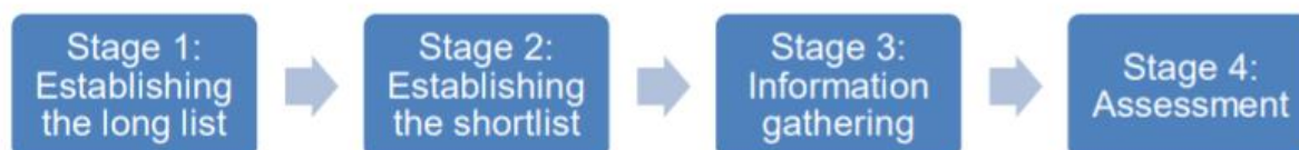
Plate 15.1 Four-staged approach to the inter-project CEA